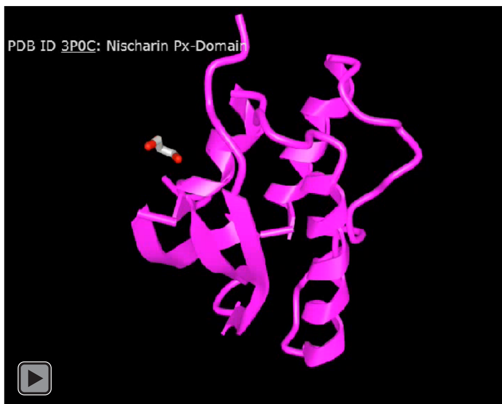
Video 1. Graphic structure of I 1 R (Madej et al. 2014)

amiloride), and I 2B R directly regulates tissue utilization of glucose (blocked by high concentrations of amiloride). Imidazoline connecting domains were found on MAO-A and MAO-B enzymes (Tesson et al. 1999). It's possible that such psychotropic effects of imidazolines as modulation of nociception, dependence and addiction formation are determined by their blocking effect on these enzymes, as they participate in the mediator systems of brain function (Gulati et al. 2009, Li et al. 2011).